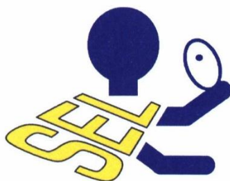
Table Tennis Club Snel en Lenig

Table Tennis Club Snel en Lenig (SEL) has been a household name in Wassenaar for more than fifty years. On September 25, 1967 the club was founded. During these years, many people have played table tennis with great pleasure. The club offers both the possibility of recreational and competitive play.